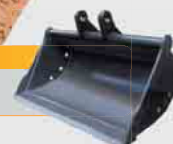
Ditch cleaning bucket